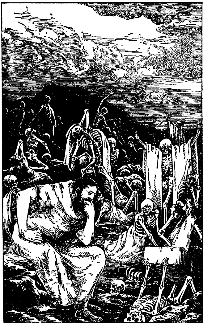
Valley of Dry Bones