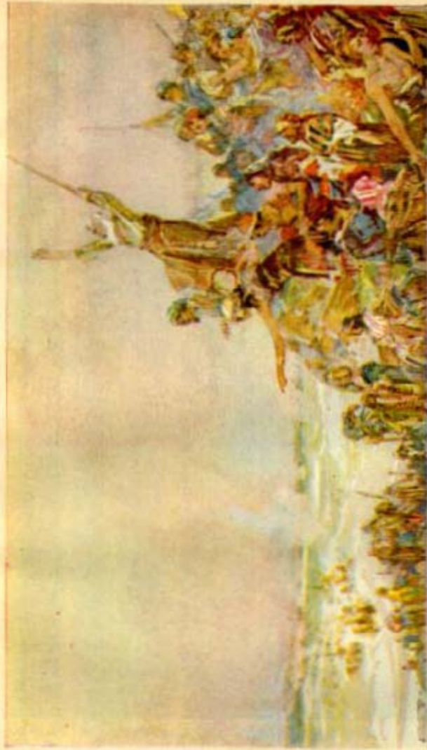
Israel's Deliverance at the Red Sea

Forebush shows the Coming Overthrow of Man's Oppressors