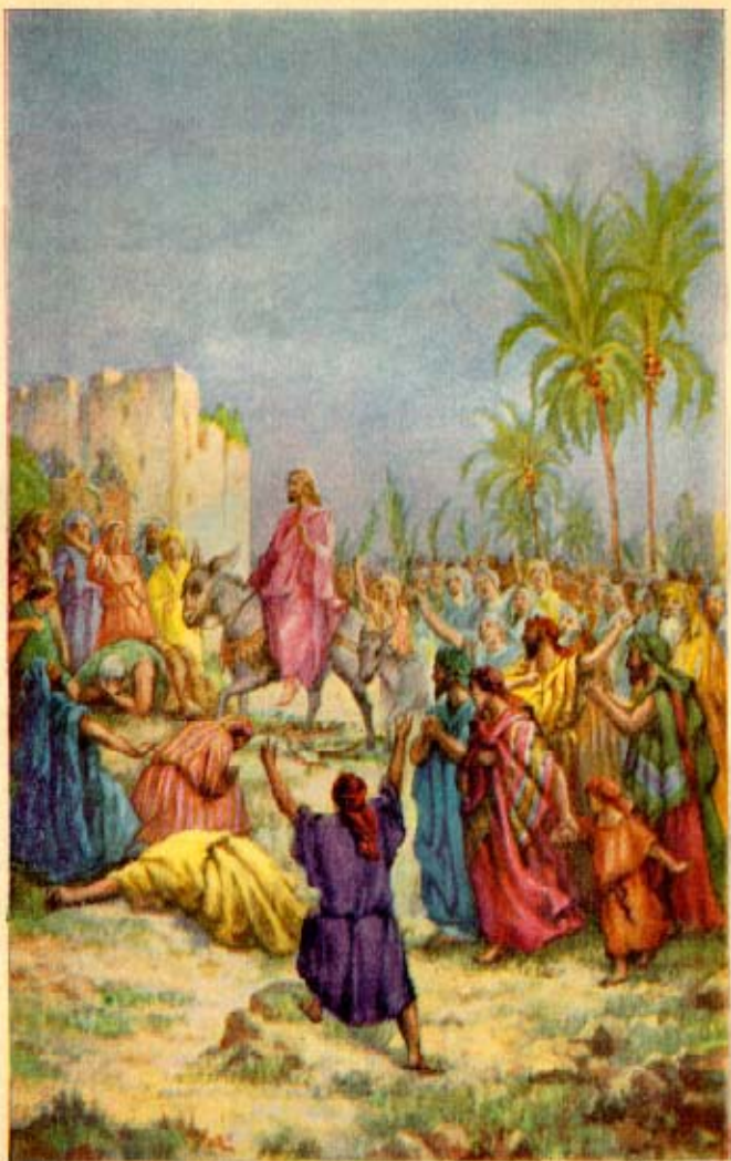
Hailing Earth's Rightful Ruler