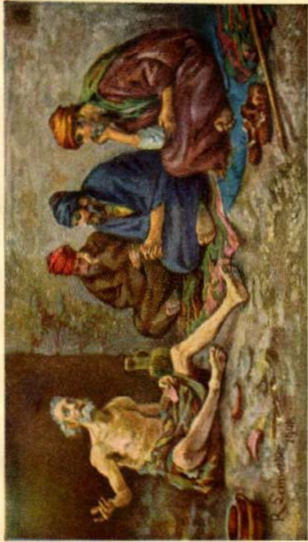
Job and Satan's Agents

Poverty Afflicted Humanity and Its False Religious Comforts