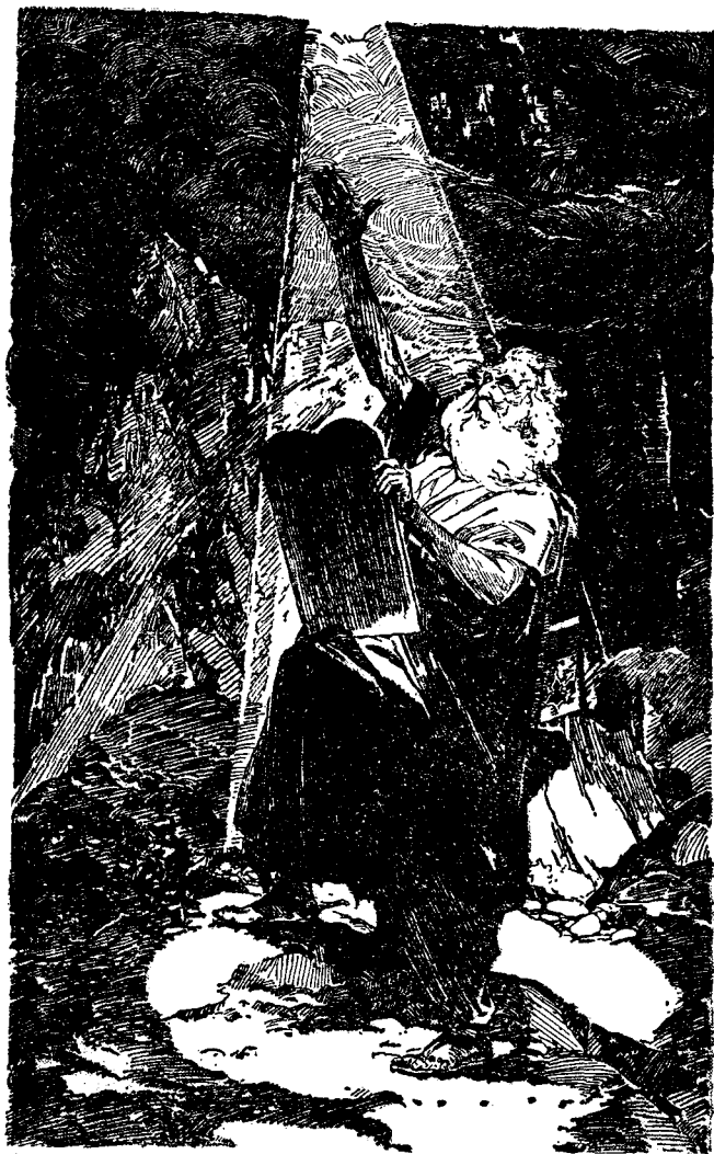
Moses Receives the Law at Mt. Sinai