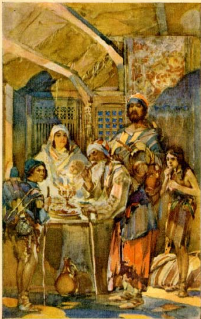
The Passover Feast