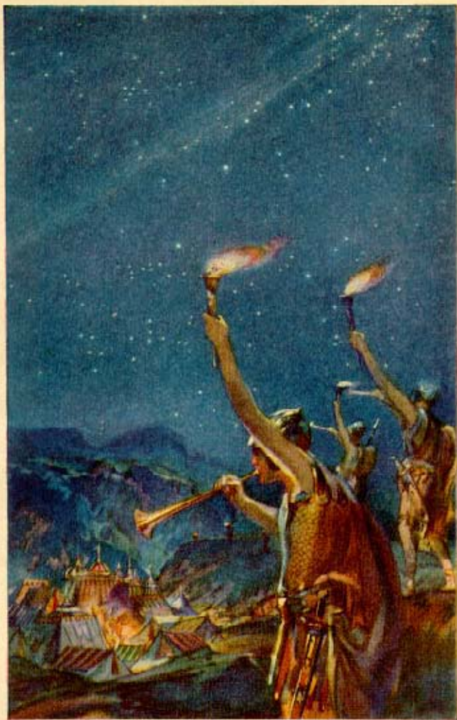
Jehovah Gives Gideon Victory over the Midianites Page 96