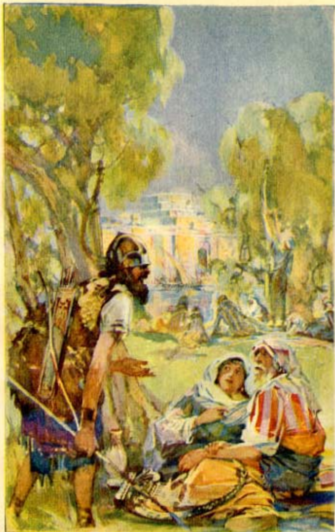
Jewish Captives Mourning in Babylon