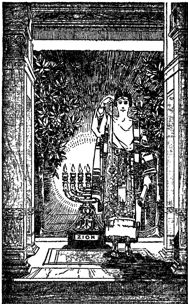
HIS EARTHLY ORGANIZATION (Zech. 4: 11-14). Page 72