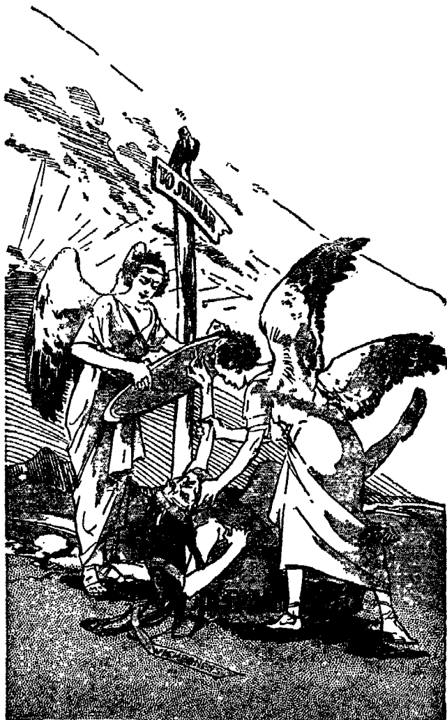
REMOVING THE OLD WOMAN (Zech. 5: 5-11) Page 84