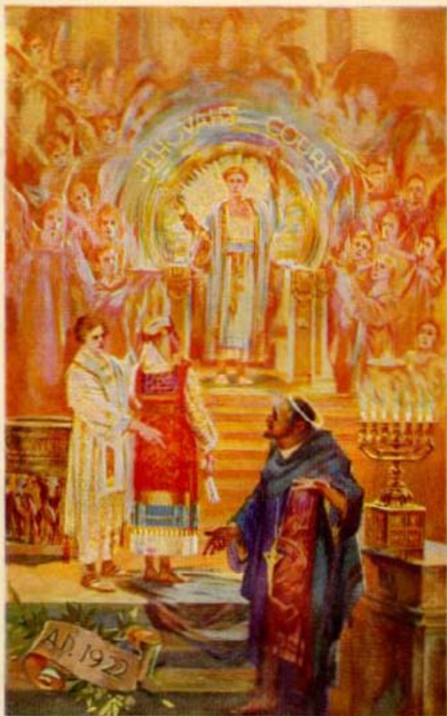
COMMISSIONED REPRESENTATIVES (ZECH. 3: 1-5) PAGE 37